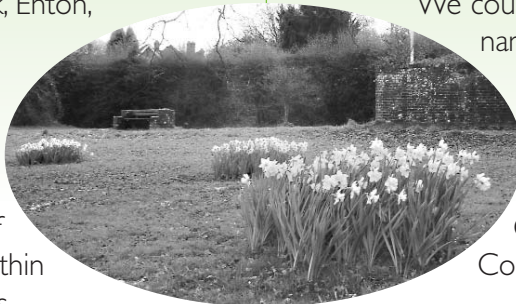
New planting of daffodils at Brook

The reason for the brief explanation is that there can sometimes be confusion because of the term 'Parish' as this is also a term used by local churches on their newsletters and magazines.