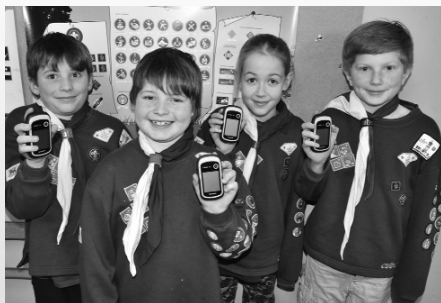
1st Witley Cub Group were delighted with their hand held GPS Units

very strongly that we should support local organisations which provide services to residents so recently we have given grants to Pirrie Hall in Brook, Chichester Hall, Milford Village Hall, Witley Cricket Club, 1st Witley Cubs and The Lovel Cycle Jumps Group and a donation to the CAB. If your organisation has a project in mind, application forms are available from the Council office.